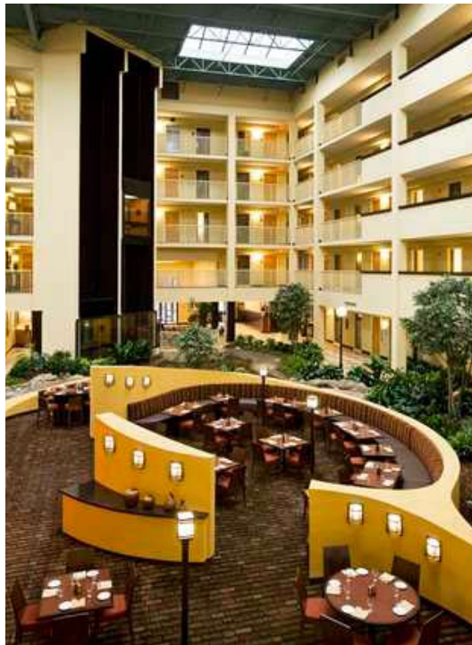
Embassy Suites Philadelphia Airport

Driving from the North, follow I-95 South towards the Philadelphia International Airport and use exit #12B, Cargo City. At the stop light, turn right. The hotel is on the right hand side. Driving from the South, follow I-95 North towards the airport and use exit #10, Cargo City. Proceed forward and at the first light, turn left onto Bartram Avenue. Travel one mile and the hotel is on the right hand side.